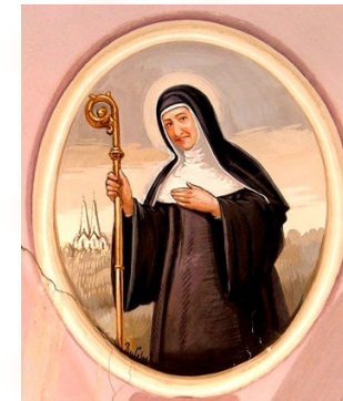
St Mechthild of Hackeborn Feast Day 19 th November

Mechtilde began her education in a convent at the age of seven and eventually became a nun in Rodersdorf, Switzerland. In 1258, she moved to the Helfta monastery, where her sister served as the abbess. At Helfta, she took on the roles of a teacher and choir director at the convent school. Mechthild was not only a visionary and mystic but also a mentor to St. Gertrude the Great, who wrote a book called "The Book of Special Grace" based on Mechthild's teachings. Initially, she had concerns that the book might cause trouble, but during prayer, Christ appeared to her, reassuring her not to worry. She became a highly sought-after spiritual advisor to her fellow nuns, the laity, and learned Dominicans. Some believe she might have inspired the character Matelda in Dante's "Purgatorio." She died on November 19, 1298, at the Helfta monastery. St. Mechthild is known for her patronage against blindness, and there is a well-known miracle associated with her, involving the healing of a blind nun. In art, she is often represented with a dove on a book, healing a blind nun, receiving a vision of Mary, or alongside St. Gertrude the Great.