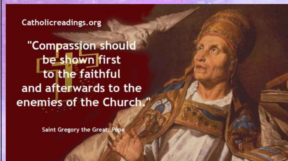
St Gregory the Great, Pope - Feast Day - 3 rd September 2023