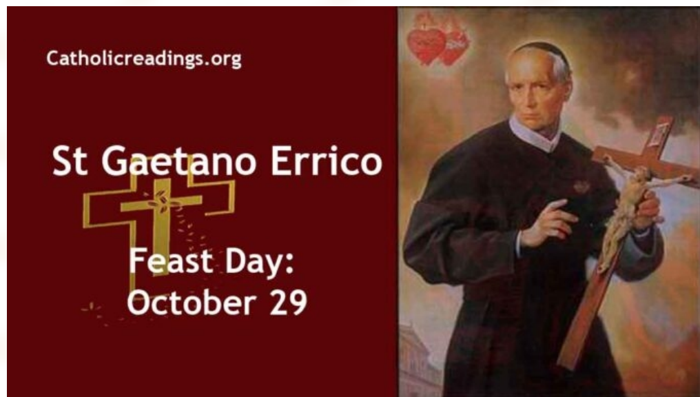
St Gaetano Errico – Feast Day – 29 th October 2023